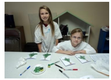
Cards for the Ronald McDonald House families