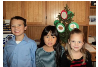
The Joshua Tree