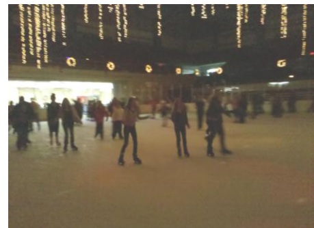
Youth Group Skate Night